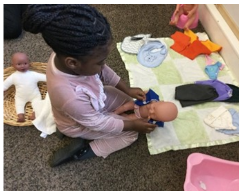
Dressing the dolls