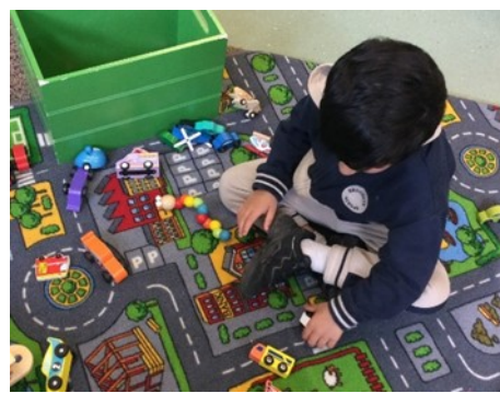
Playing with the cars