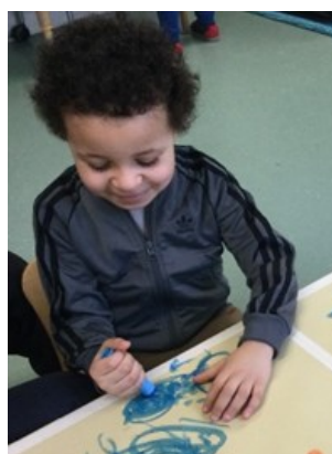
Using the paint sticks