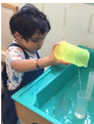
Exploring filling and emptying

It also encourages the learning of new skills that can foster the development of our self-confidence to discover more.